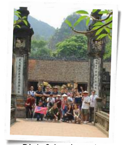
Dinh & Le dynasty

Hanoi – Ninh Binh => 2.5 hour transfer included breaktime on the way Distance